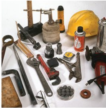
JAWS 2.0 can find and retrieve almost any dropped object!